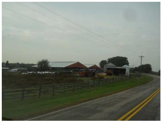
A fully-operational dairy in the vicinity of the Coles Hill site